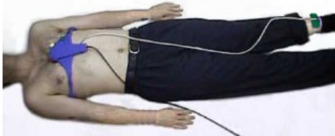
Figure 2: ECG Belt on patient

It is important that the patient is relaxed and does not strain his/her muscles during the examination. The patient should try not to move or talk during the examination